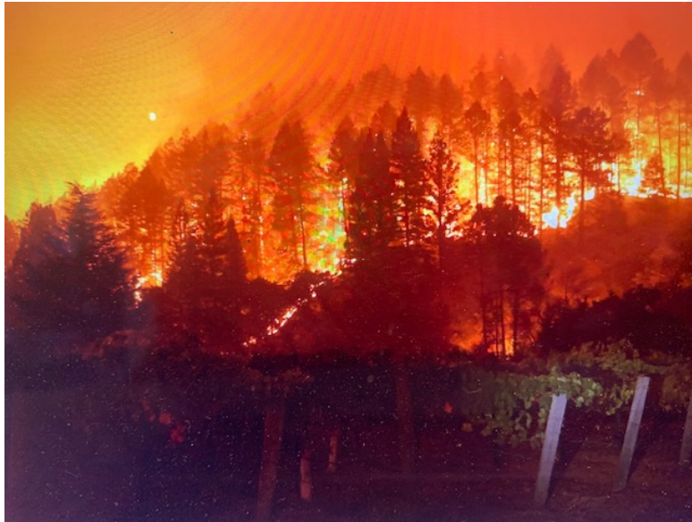
Glass Fire September 27, 2020